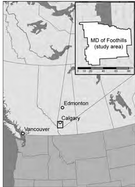
Figure 1. Study area map and boundaries, Municipal District (MD) of Foothills and Bragg Creek.

The study area was within the Municipal District 31 of Foothills (50° 19' to 50° 55' N; 113° 30' to 114° 31' E) in southern Alberta, Canada (Figure 1), encompassing an area of 1,448 km 2 . The region contained numerous small to mid-sized communities, with 100 to 700 households per community and a rural population of approximately 7,065 people (Statistics Canada 2006, MADGIC 2007). The region was characterized by topography ranging from rolling grasslands to wooded foothills extending westward toward the Rocky Mountains. The northern boundary of the study area was adjacent to the city of Calgary, with a population of approximately 1 million, and the Foothills Municipal District of was one of the fastest-growing districts in Alberta (AlbertaFirst 2007). Agriculture was the predominant land use in the Foothills, with cattle ranching and cultivation constituting a large portion of the agricultural activities. Petroleum development and some forestry constitute the industrial uses of the land. However, it was the rapidly-increasing demand for rural residential subdivision that was the primary driver of significant regional landscape change. This trend was consistent with the rural migration that characterizes much of the Rocky Mountain West (Duke et al. 2003, Papouchis 2004, Southern Foothills Study 2007, White 2007) and made the study area representative and relevant to many other parts of North America.